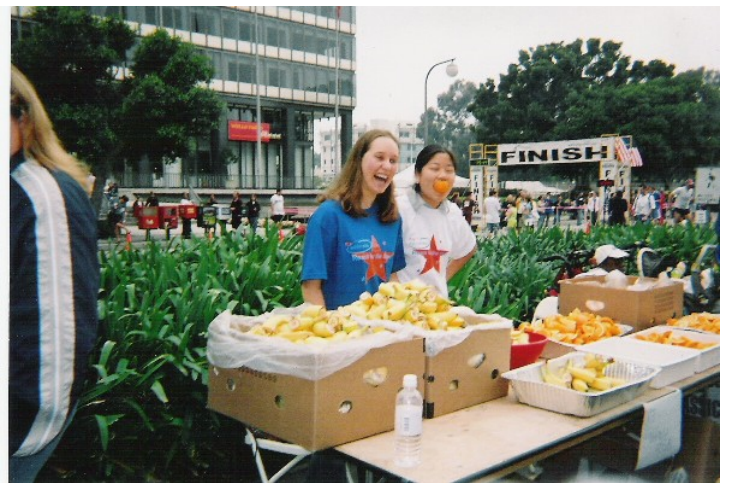
BEVERLY HILLS HIGH SCHOOL STUDENTS

Springtime allowed us all to reflect on our students' accomplishments at the National Service-Learning Conference in Long Beach. Administrators, parent leadership, teachers attended the conference along with El Rodeo and BHHS students who presented their own S-L Showcase pieces to conference attendees. The conference also sent attendees on a site visit to Hawthorne School to observe the annual Jump Rope for Heart Service-Learning project when students jump rope for the