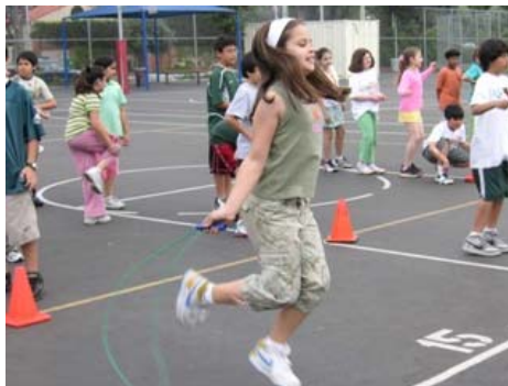
THIS JUMP ROPE FOR HEART SERVICE-LEARNING PROJECT AT HAWTHORNE WAS SHOWCASED FOR GUESTS VISITING FROM THE LONG BEACH NATIONAL SERVICE-LEARNING CONFERENCE.

Two schools, Beverly High and Horace Mann, organized whole school participation, and we began to even better appreciate how results are magnified when we are united and working collaboratively. Community/Service-Learning speaks to who we are as a District, our deep concerns and the strong values we hold so dear. As stated in our Mission Statement... we are